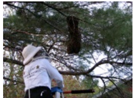
Figure 1 - An impressively large swarm of bees

In an ideal world, you would capture a large, healthy swarm. This is a colony of bees with a mated queen, who led approximately half of a thriving colony out of their home in search of a new beginning. These bees will be seriously motivated and well organized, with a “hive mind” consensus, to build honeycomb—as a place for their queen to begin laying.