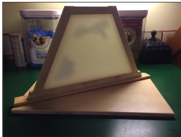
Figure 4- Gold Star Fondant Feeder

Please note that if the weather is expected to be chilly - say, below 50°F, you should consider providing fondant for your newly-hived package. At temperatures below 50°F, your bees will need to stay in their cluster to survive , and they will not be able to visit a distant syrup feeder. Gold Star Honeybees offers a fondant feeder frame that hangs in the hive much like a honeycomb, and provides food that the bees can reach while they are in cluster.