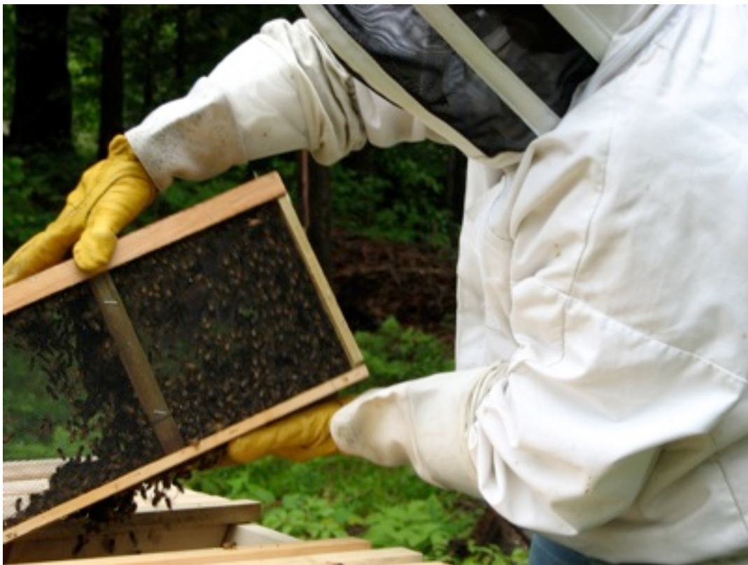
Figure 8 Ouring the bees into the bee bowl

You may need to thump on the box a little bit to knock the majority of the bees out of the box and into the hive. When most of them are in the hive, set the box with any stragglers beneath the hive. They will find their way in eventually.