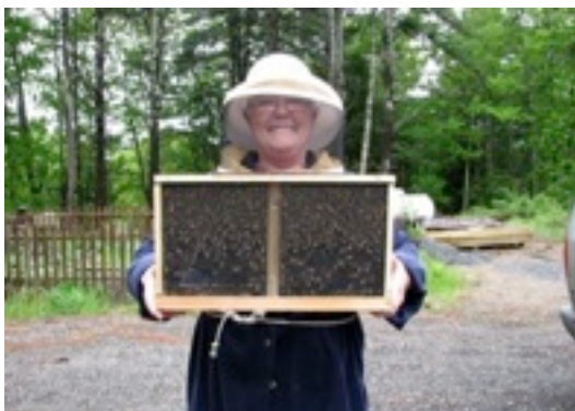
Figure 2 - A good looking package of honeybees

However, swarms are somewhat random events of nature, and you may or may not connect with one. So, another method of obtaining bees is to purchase a “3-pound package” of bees from a honeybee supplier. Where this gets tricky is that to order bees, you need to plan far in advance—January or February is not too early to be shopping for bees! A swarm, on the other hand, is more of a “drop everything and go collect them” event—likely in May or June. Great if you can get ‘em. If not, you’ll want to have purchased a package in advance.