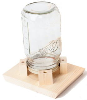
Figure 3 - Gold Star Syrup Feeder

the feeder base into the hive, fill the one-quart Mason jar with the syrup, screw on the lid with the small holes in it, then go outside to your hive, and upend the jar. Wait a few moments until it ceases to drip and then set it into the blocks in the feeder base.