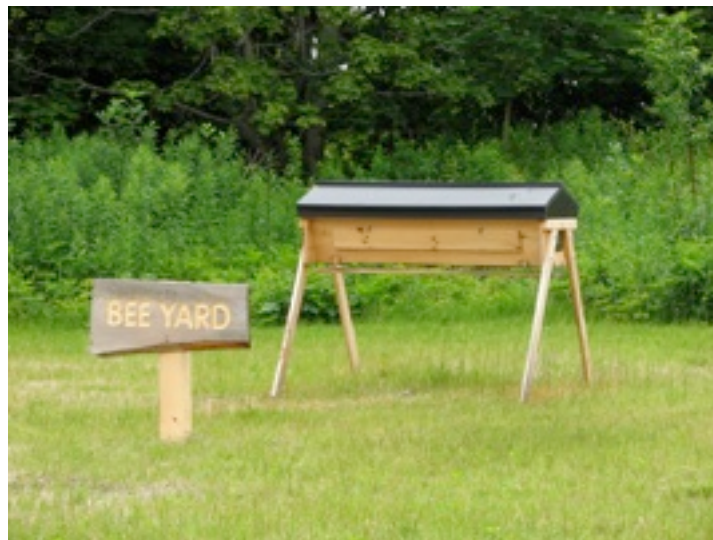
Figure 9 - Welcome to the bee yard

Thank you for making Gold Star Honeybees a part of your beekeeping journey!