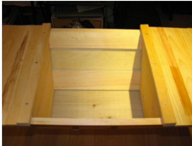
Figure 5 - The "Bee Bowl"

It should look like this - kind of like a “bowl” for your bees!