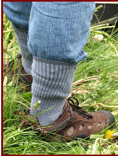
Figure 6 - The Beekeeper's Fashion Statement

If you've got the jacket, pay particular attention to where the zippers all come together under your chin, and use the Velcro that is there to prevent any stray bees from getting inside your veil. It's smart to tuck your pants into your socks, too, and we know you're already wearing close-toed shoes, right? Put your gloves on last, maybe even wait until you've got the package open to add your gloves.